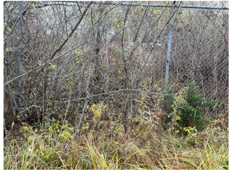
PP09, Facing West