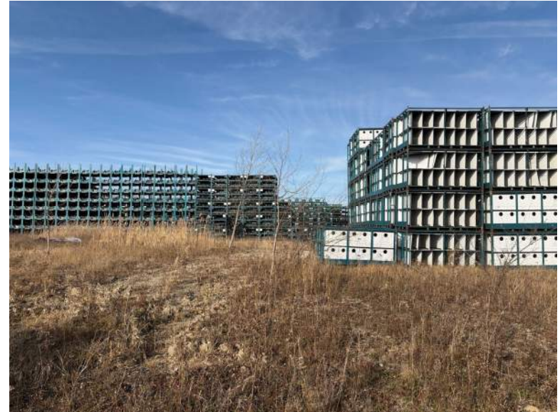
PP20, Facing North