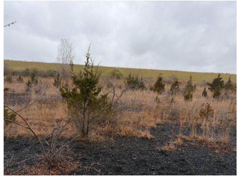
PP08, Facing West