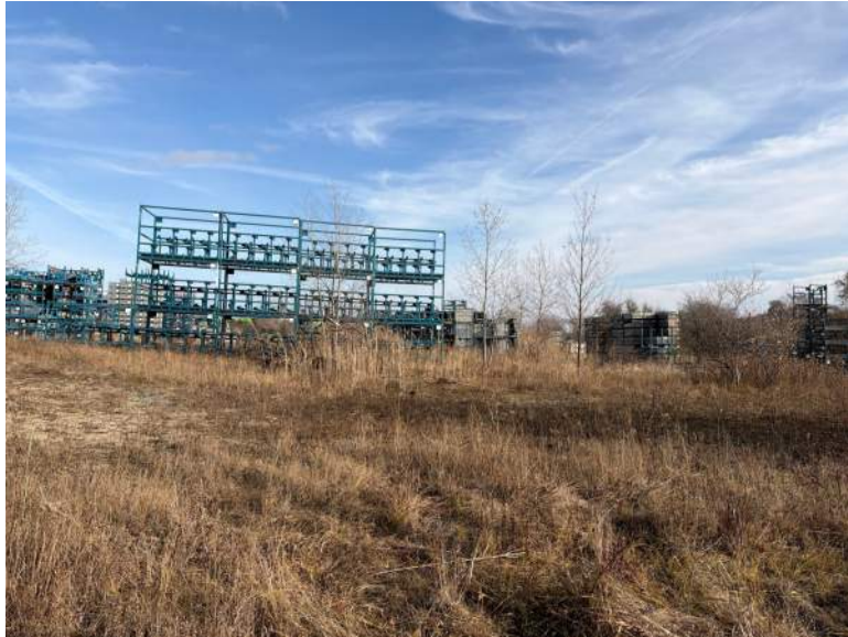
PP20, Facing East