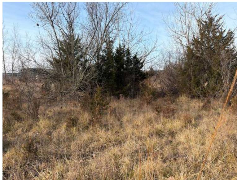
PP14, Facing West