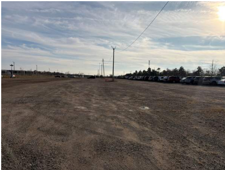
PP23, Facing South