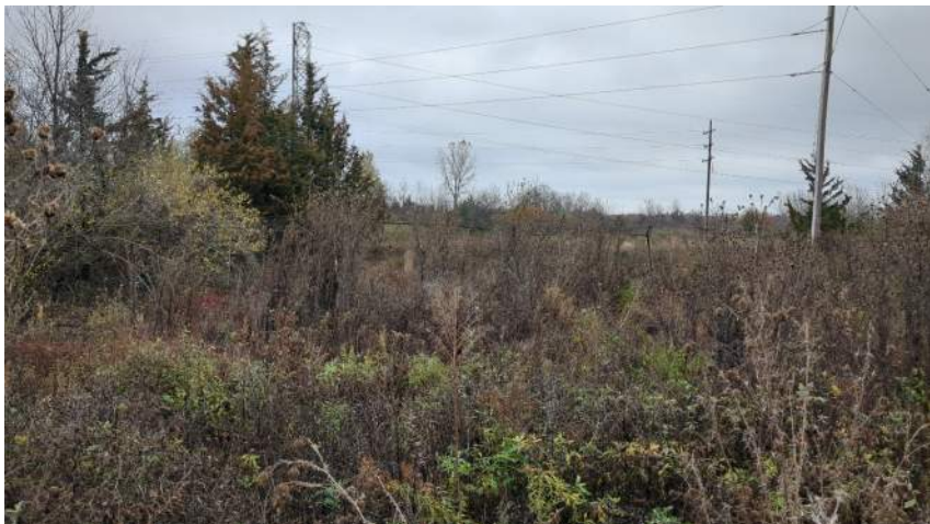
PP04, Facing East