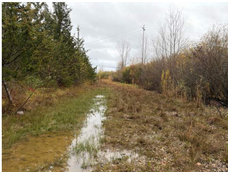
PP01, Facing South