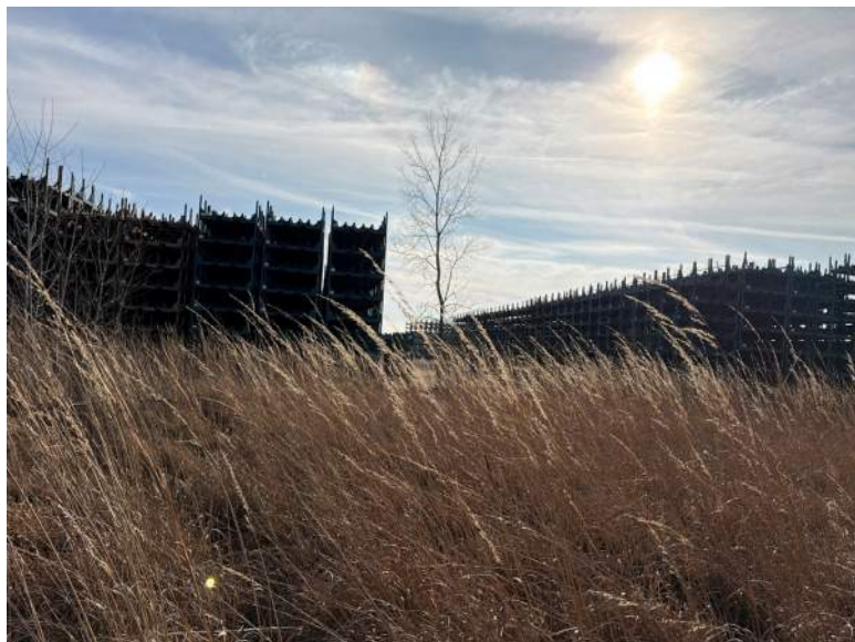
PP19, Facing South