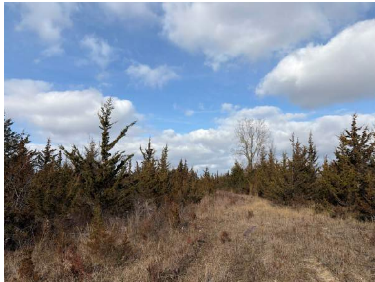
PP17, Facing North