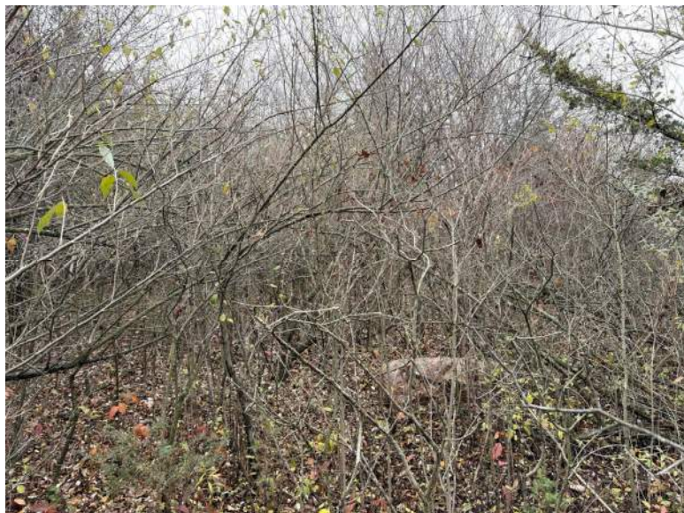
PP07, Facing East