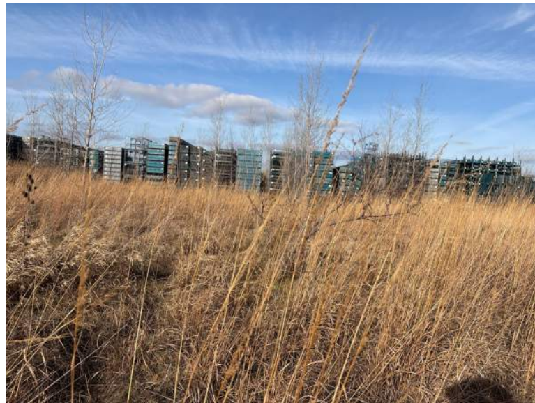
PP19, Facing North