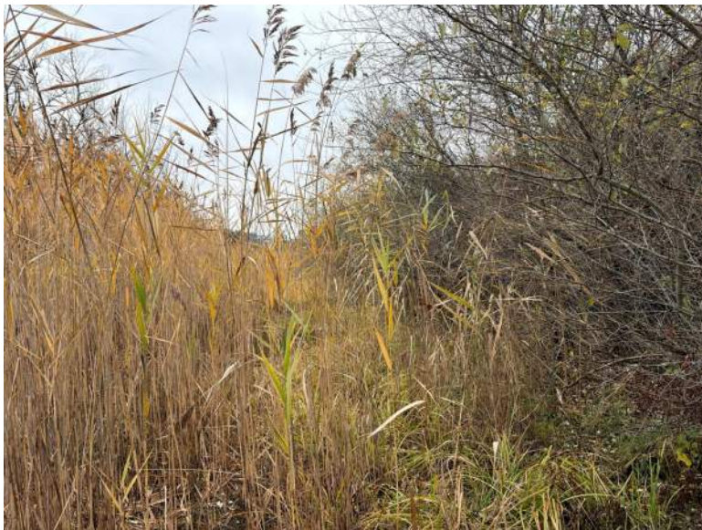
PP09, Facing South