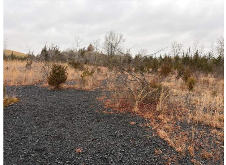
PP08, Facing North