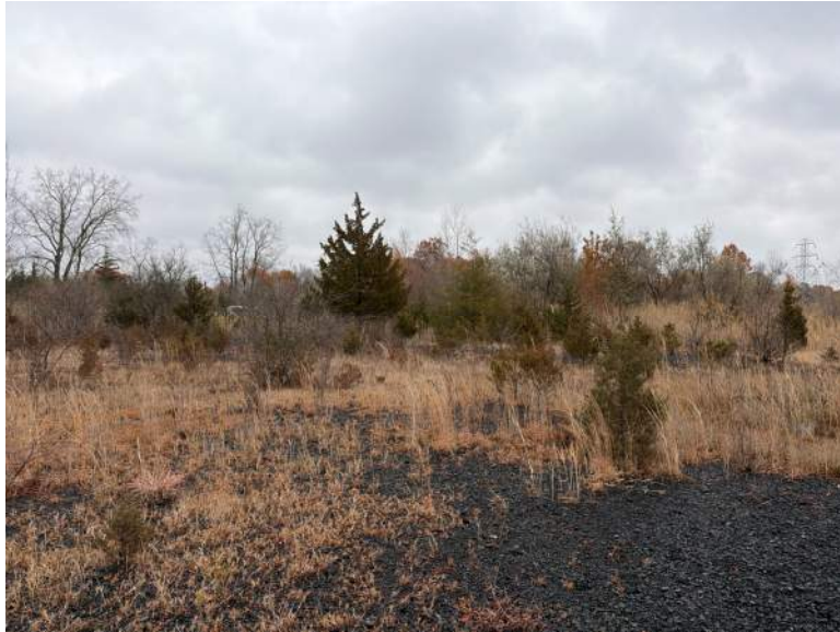
PP08, Facing East