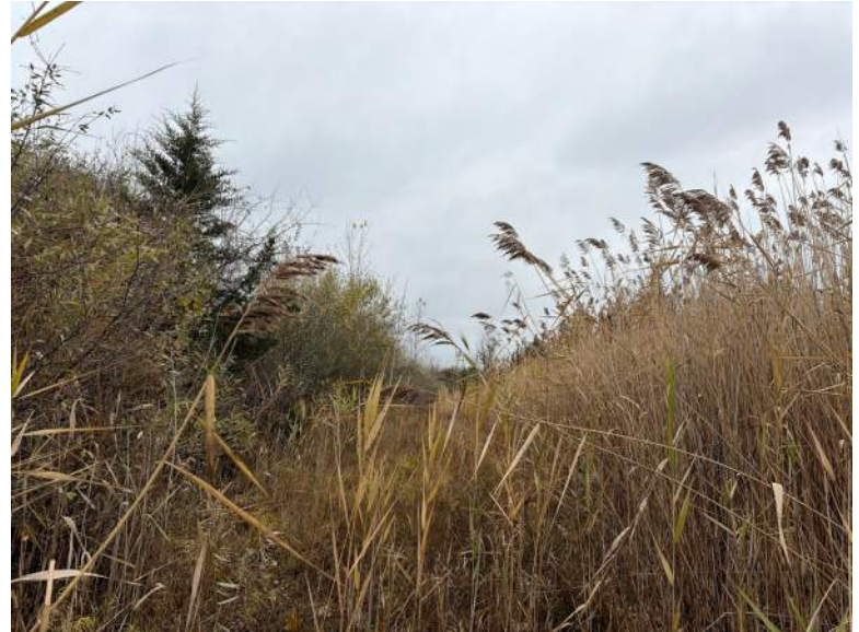
PP06, Facing North