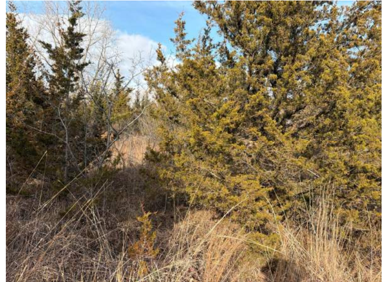
PP18, Facing North