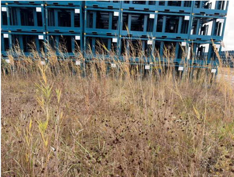
PP11, Facing East