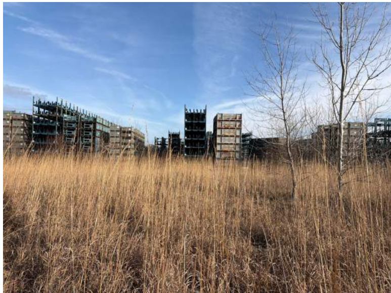
PP19, Facing East