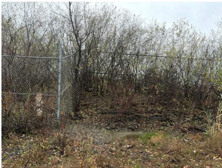
PP01, Facing West