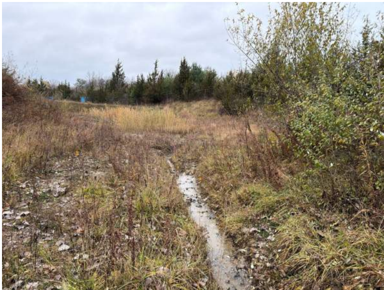
PP03, Facing Northeast