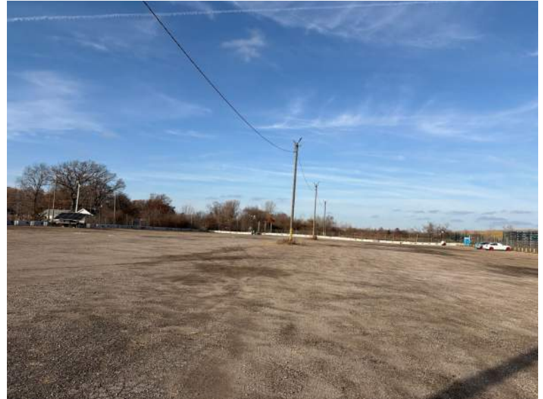
PP23, Facing North