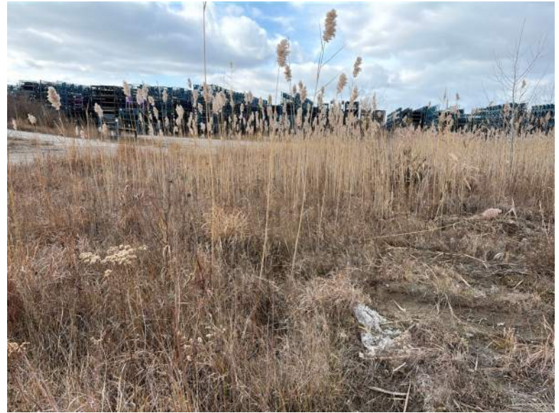
PP15, Facing West

Disturbed Uplands with Gravel/ Asphalt Road and Emergent Wetlands (Bottom Right)