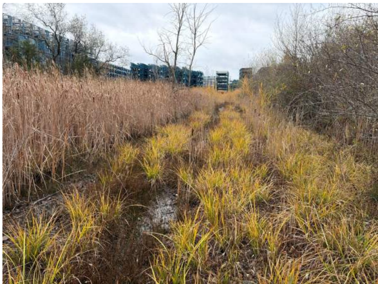
PP10, Facing South