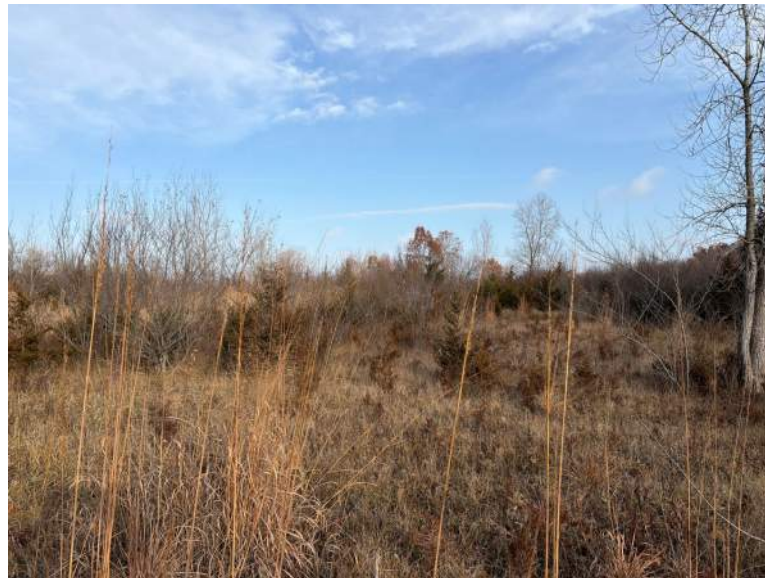
PP14, Facing North