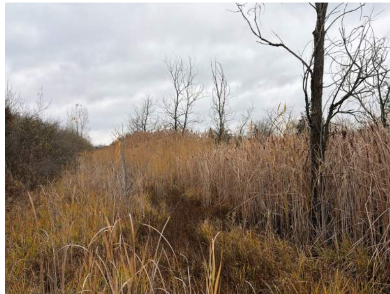
PP10, Facing North