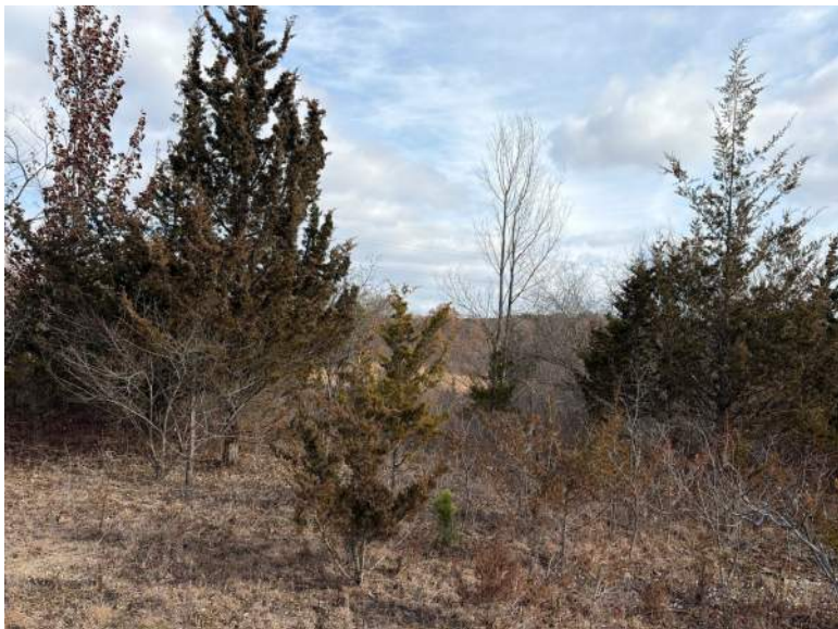
PP17, Facing East