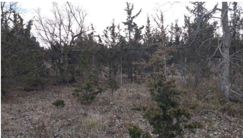
PP16, Facing South