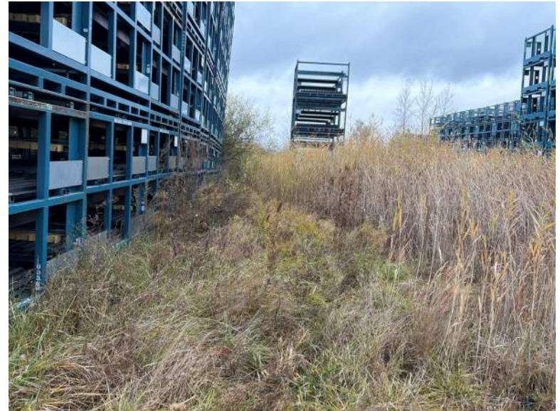
PP11, Facing North