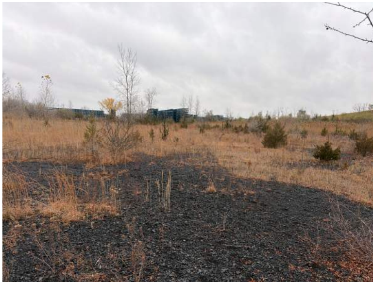
PP08, Facing South