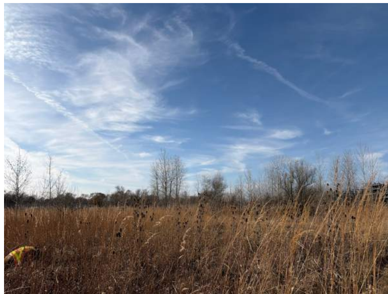
PP19, Facing West