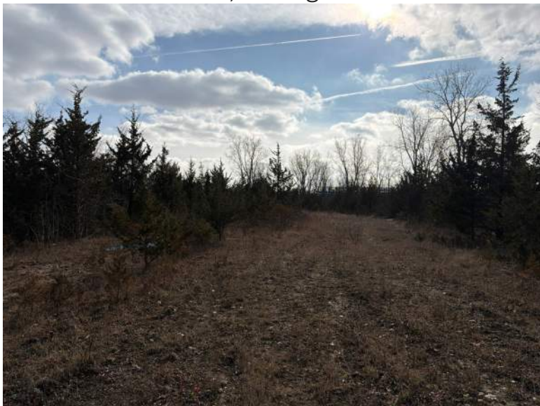
PP17, Facing South