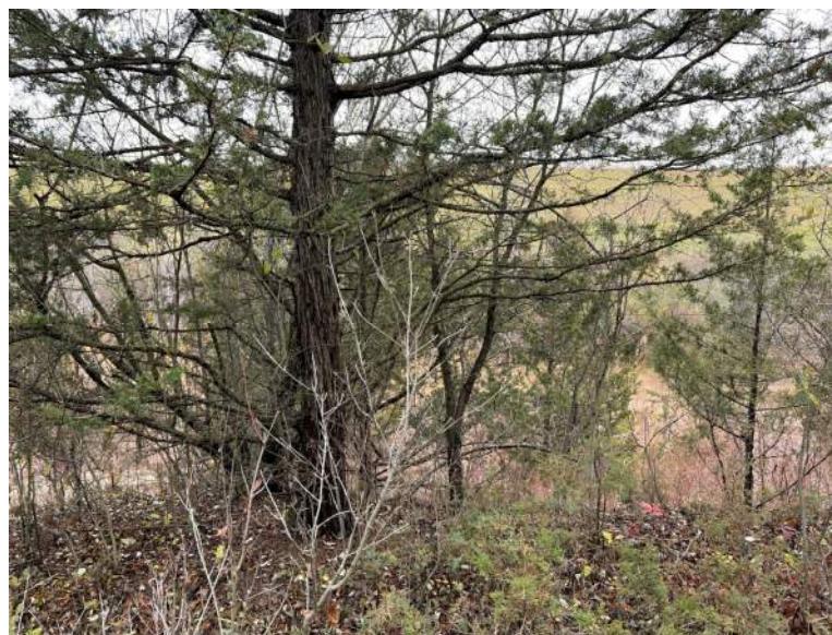
PP07, Facing West