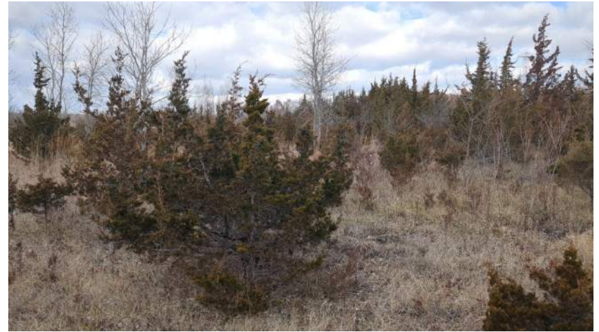
PP16, Facing North