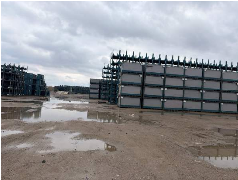
PP13, Facing South