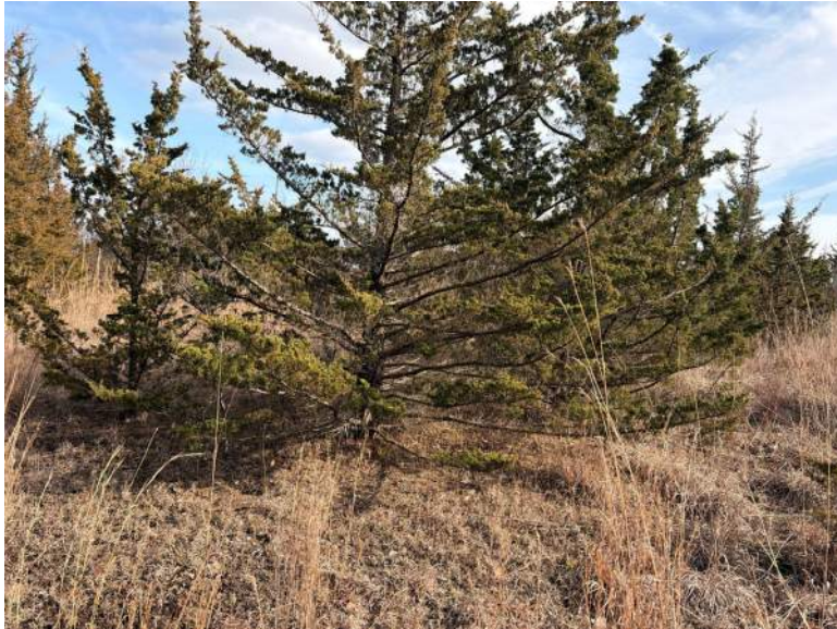
PP18, Facing East