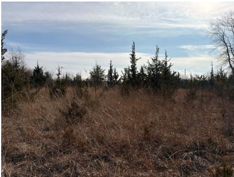
PP18, Facing South