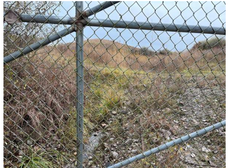
PP03, Facing Southwest