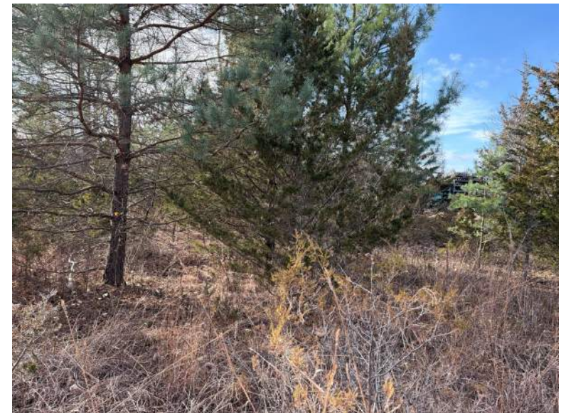
PP18, Facing West