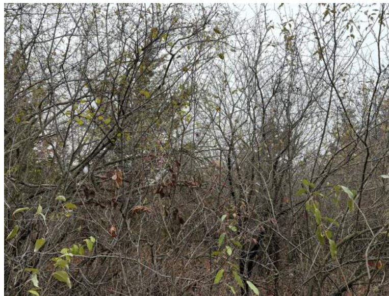
PP07, Facing North