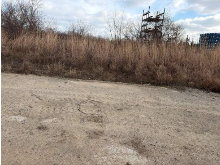
PP15, Facing East