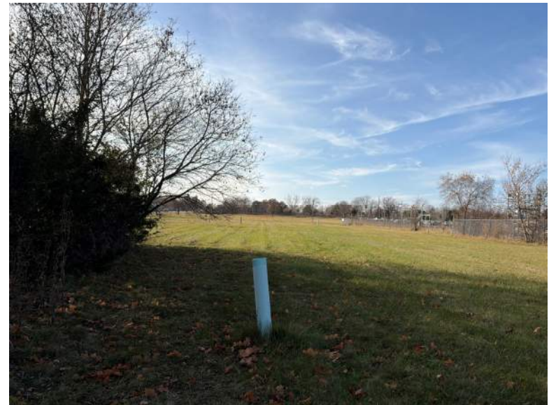
PP22, Facing West