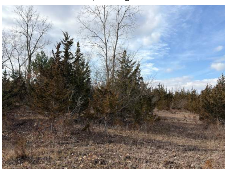
PP17, Facing West