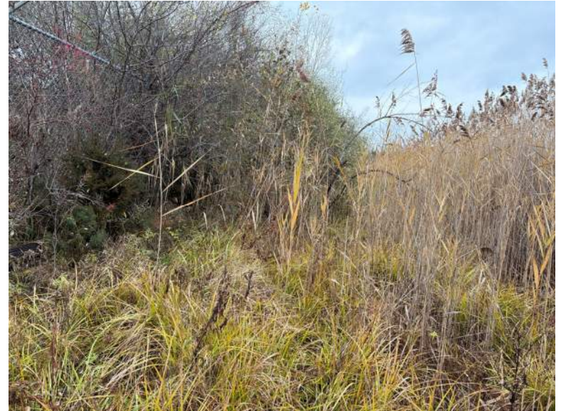
PP09, Facing North