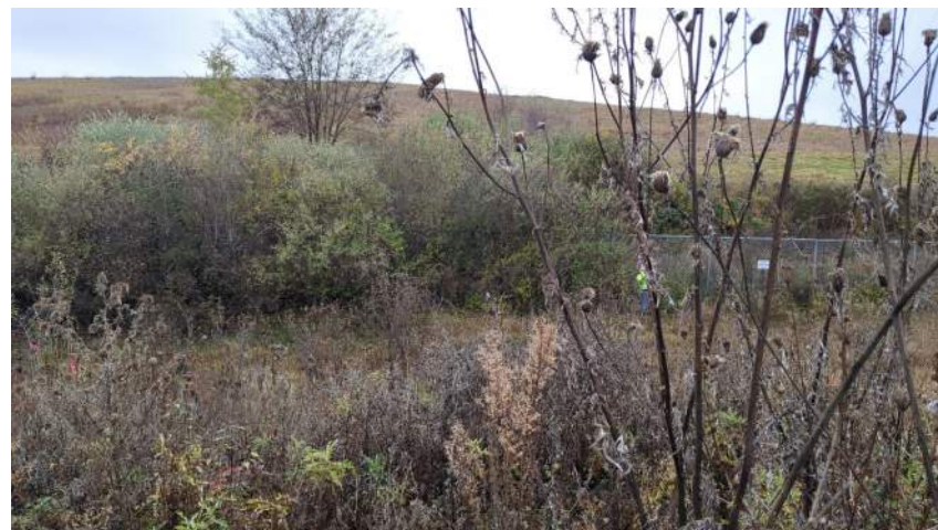
PP04, Facing West