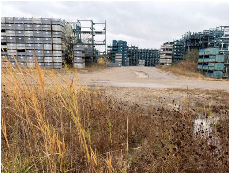
PP11, Facing South