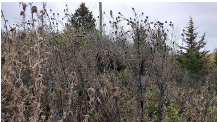
PP04, Facing South