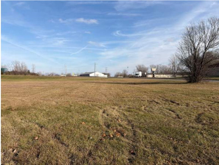
PP21, Facing East