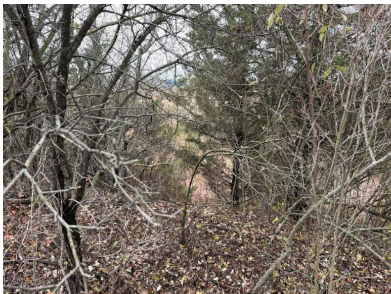
PP07, Facing South