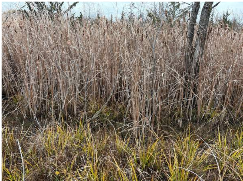
PP10, Facing East