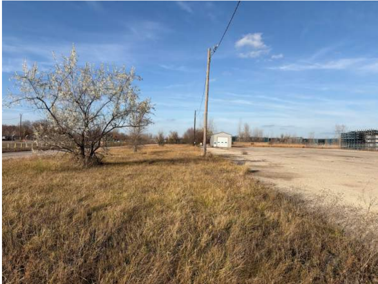
PP24, Facing North