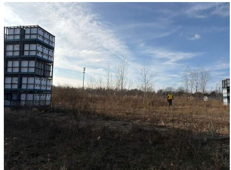
PP20, Facing West