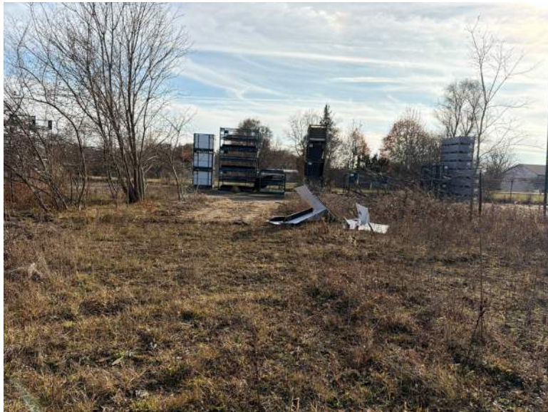
PP20, Facing South