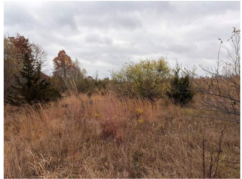
PP12, Facing Southwest