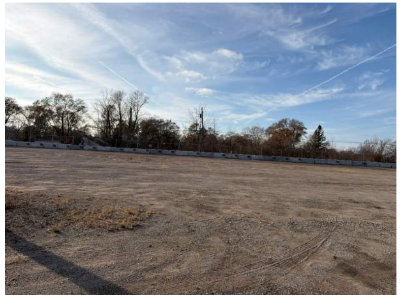
PP23, Facing West