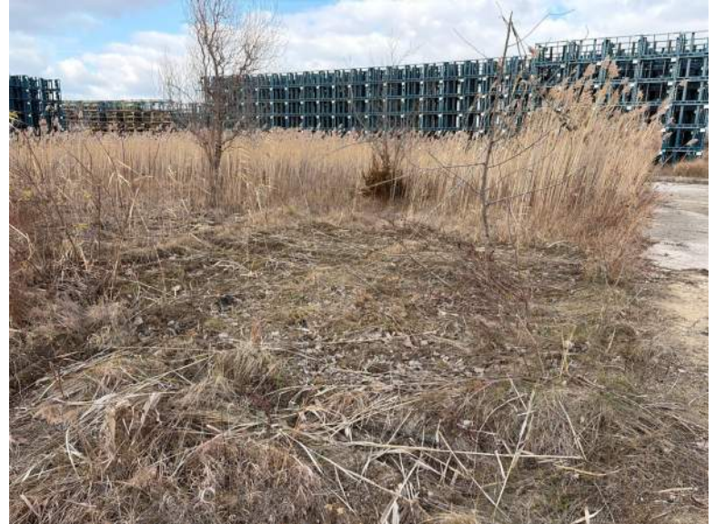
PP15, Facing North