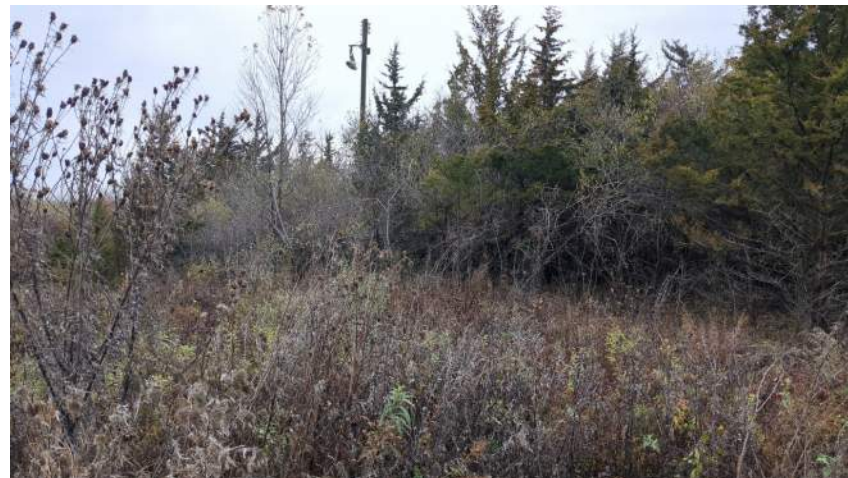
PP04, Facing North