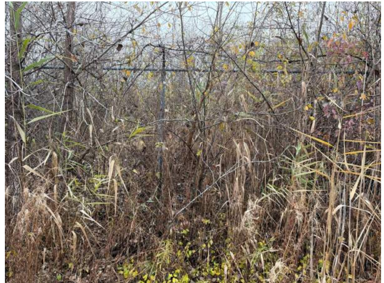
PP06, Facing West