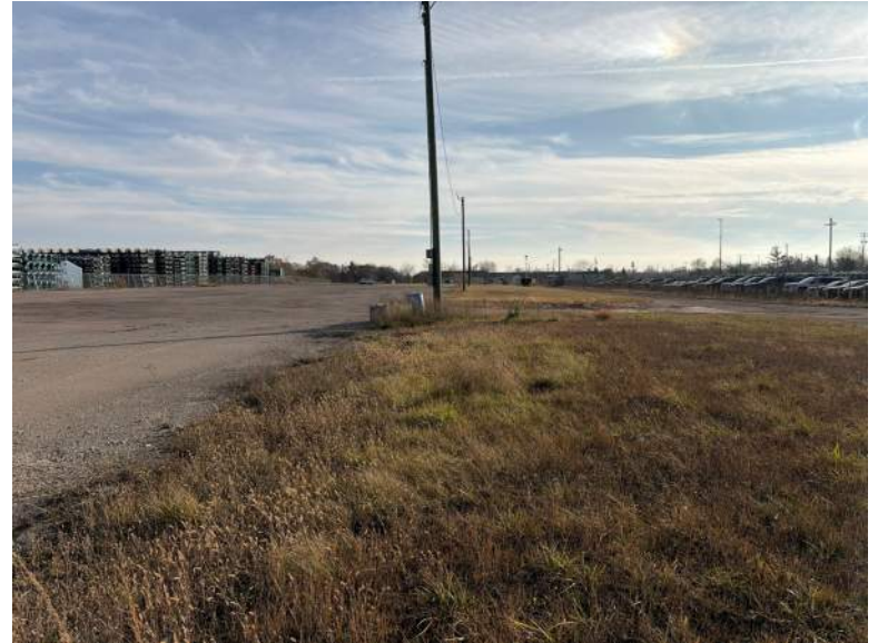
PP24, Facing South