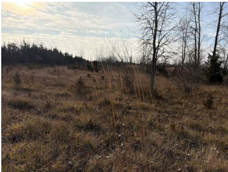
PP14, Facing South