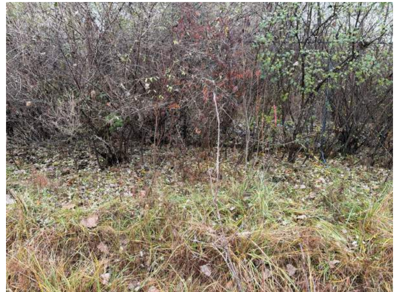
PP05, Facing West