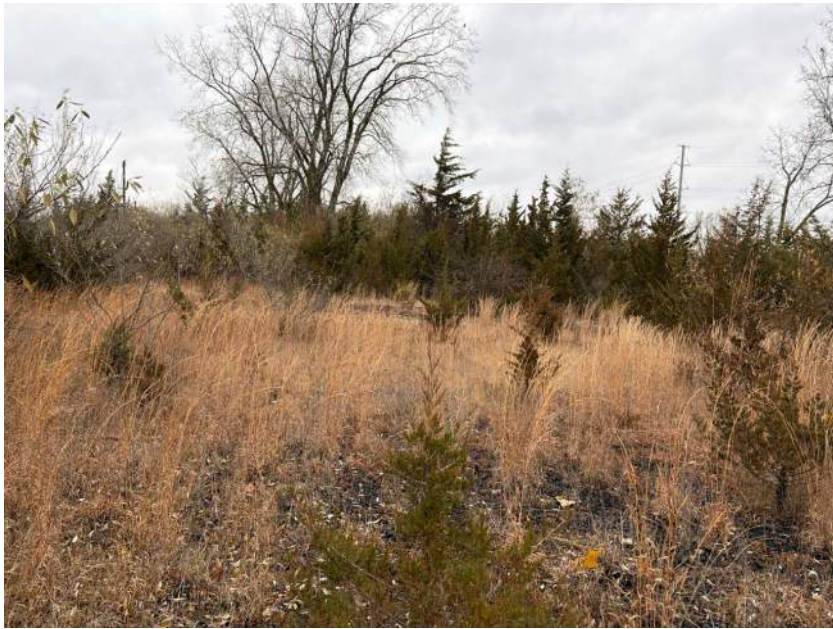
PP12, Facing Northeast