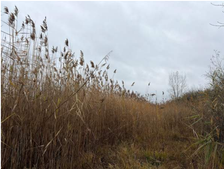
PP06, Facing South