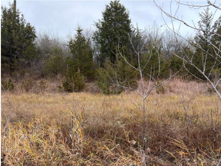
PP05, Facing East