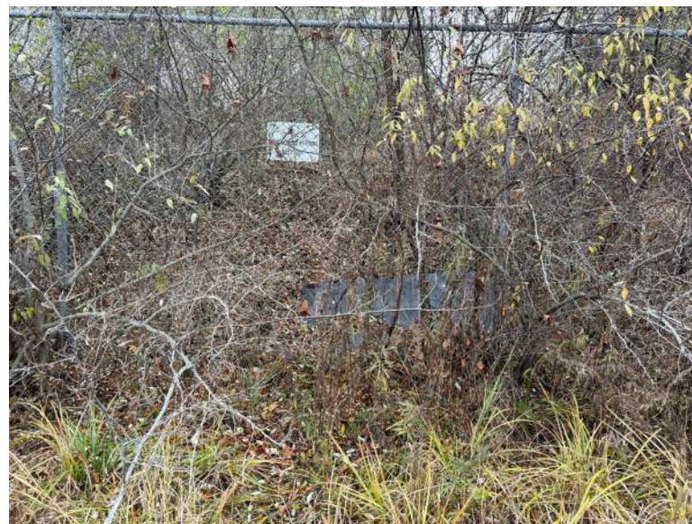
PP10, Facing West