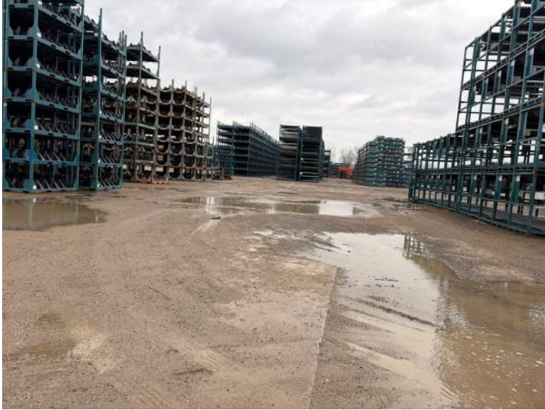
PP13, Facing East