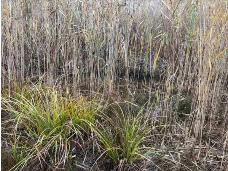
PP09, Facing East