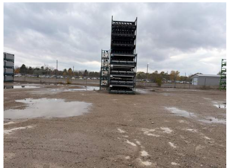
PP13, Facing West