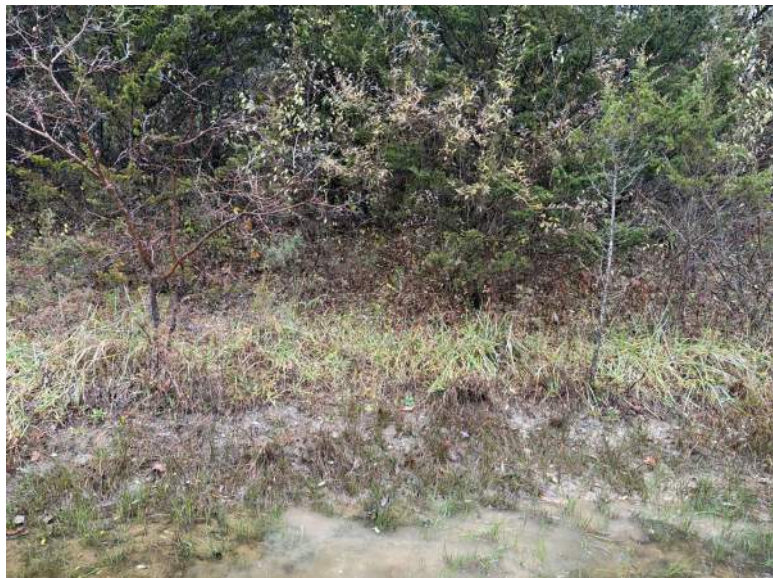
PP01, Facing East