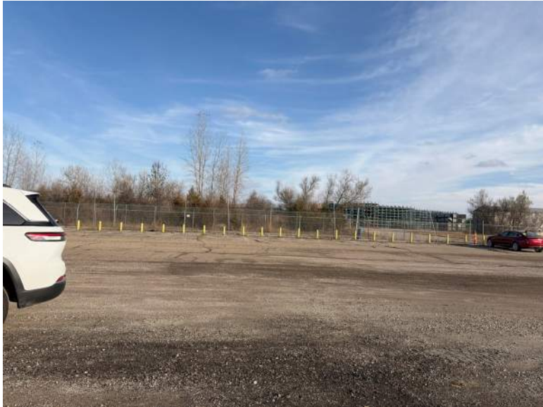
PP23, Facing East