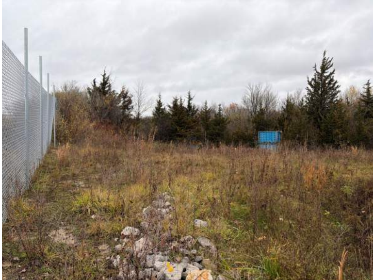
PP02, Facing Northeast