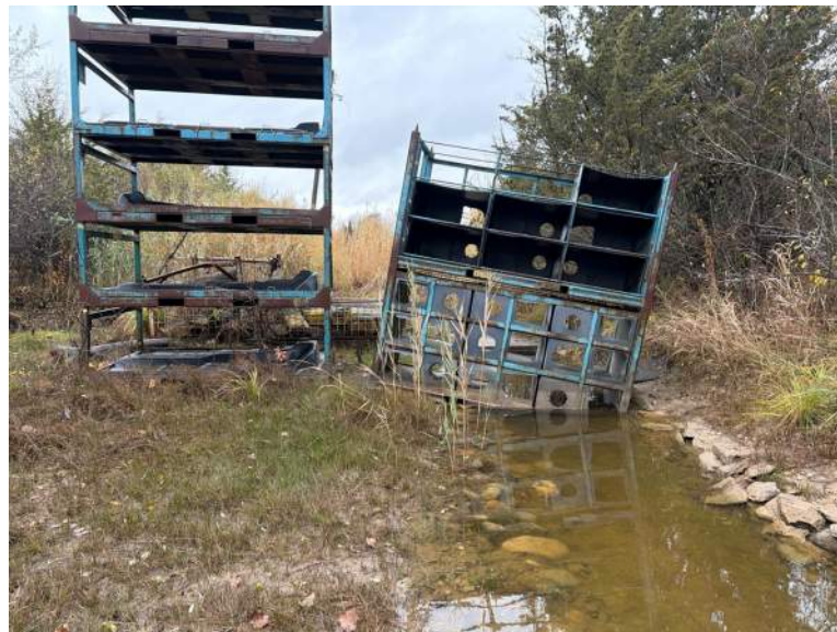
PP01, Facing North