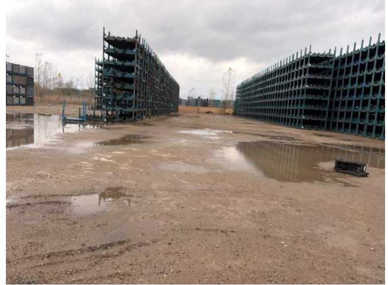
PP13, Facing North