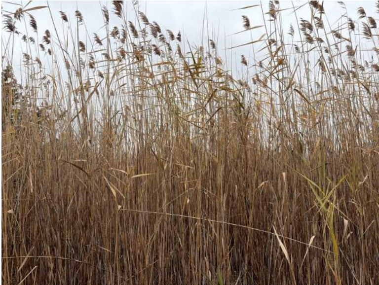
PP06, Facing East