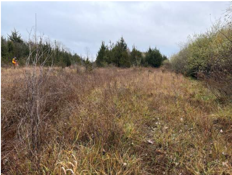
PP05, Facing Southeast