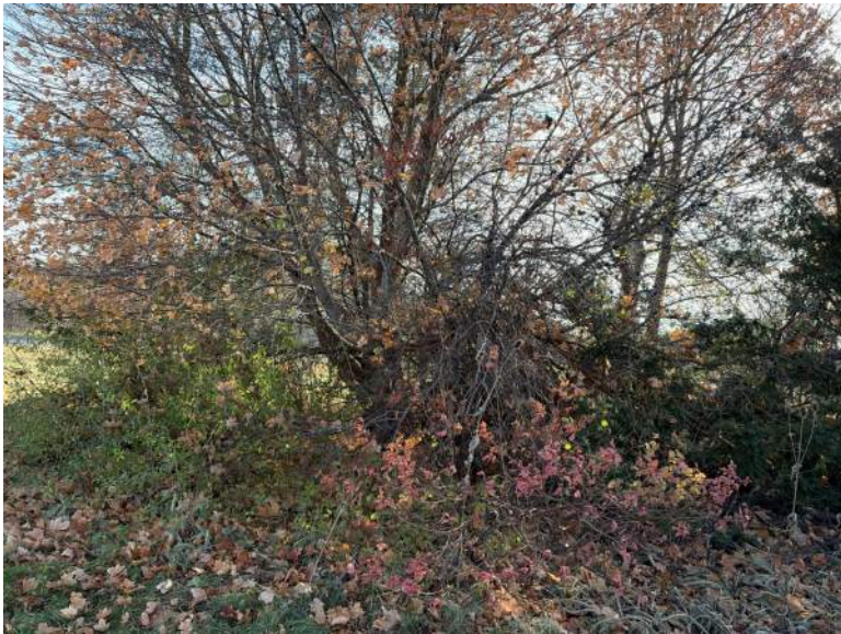
PP22, Facing South