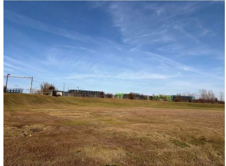
PP21, Facing Northeast