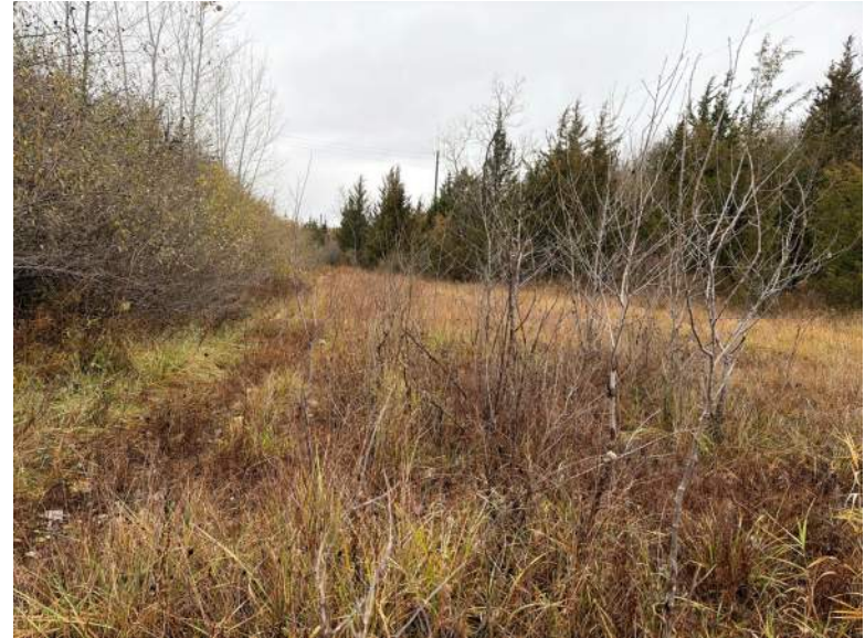
PP05, Facing Northwest