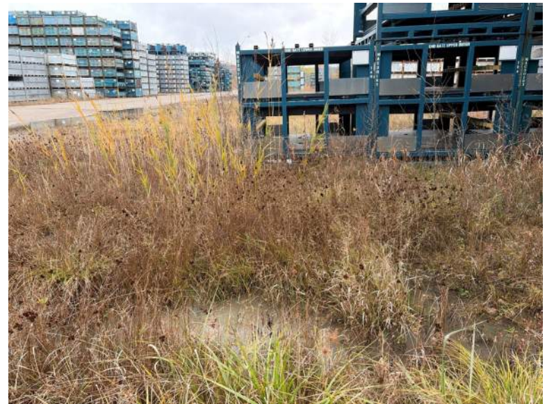
PP11, Facing West