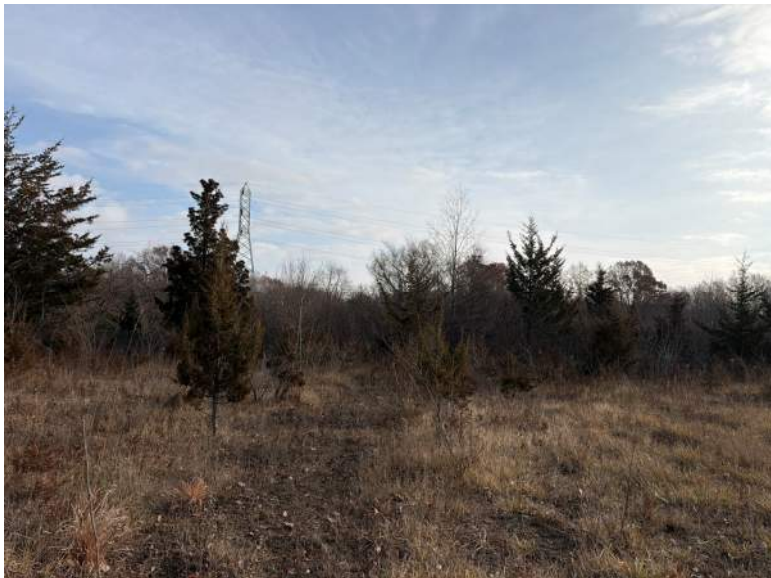
PP14, Facing East