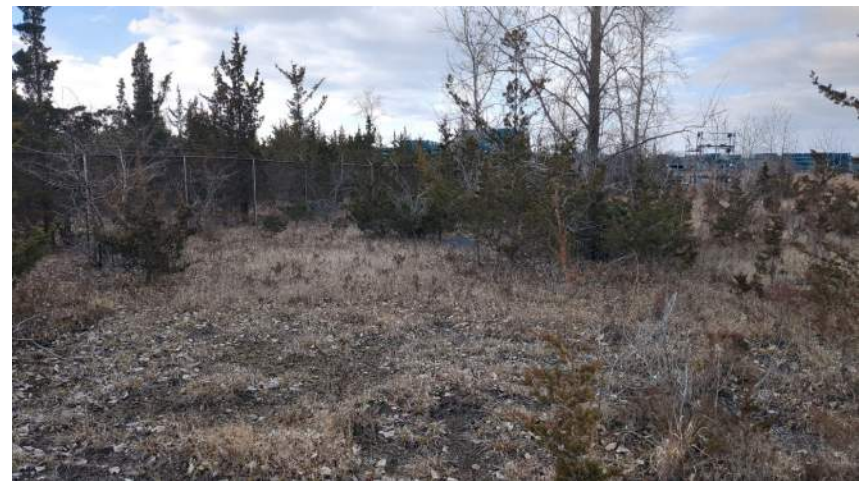
PP16, Facing West