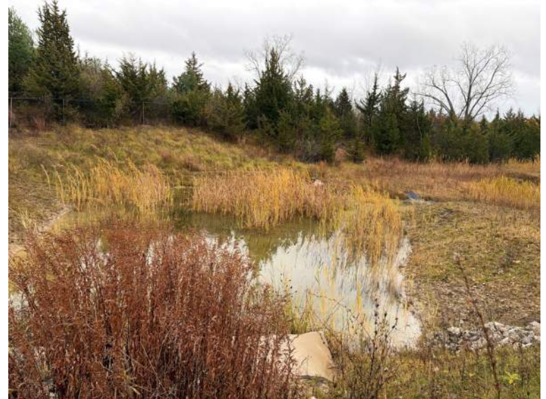
PP02, Facing Southeast