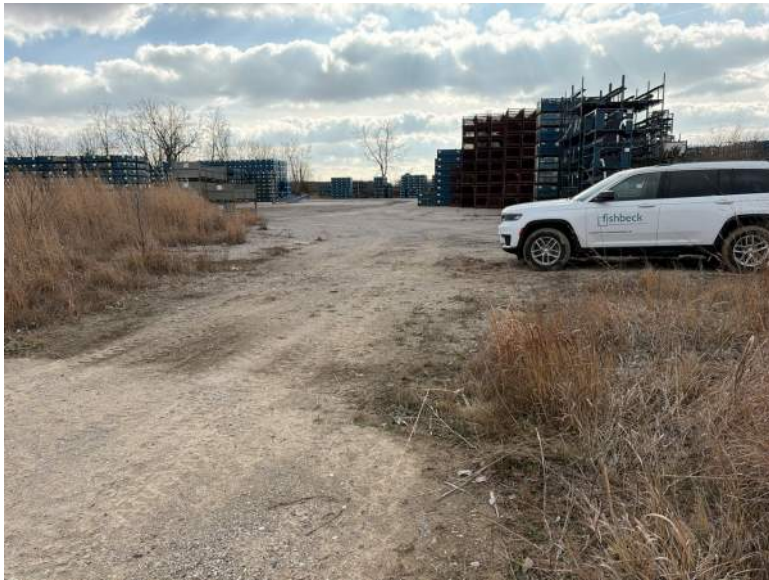
PP15, Facing South