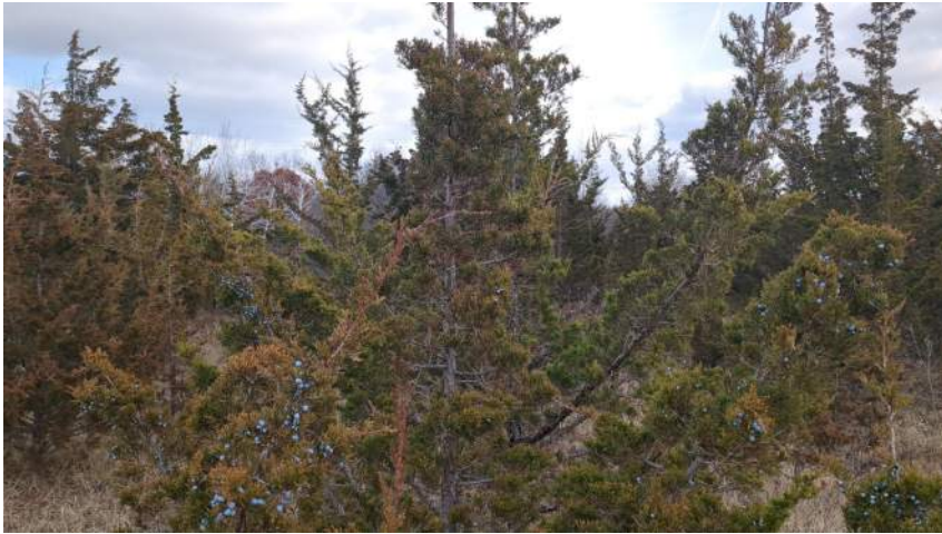
PP16, Facing East