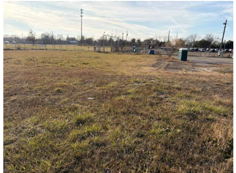
PP25, Facing Southwest