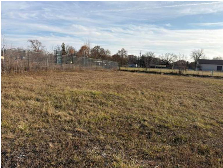
PP25, Facing Southeast