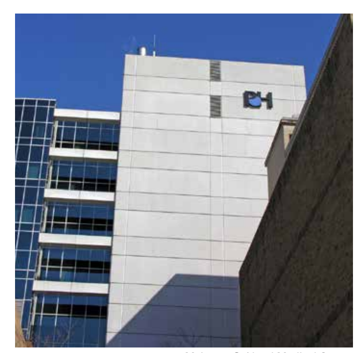
McLaren-Oakland Medical Center

Crittenton Hospital Medical Center in Rochester is a 290-bed acute-care facility serving communities in Oakland, Macomb and Lapeer counties.