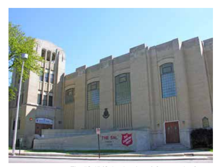
The "Sal" (Salvation Army) Community Center