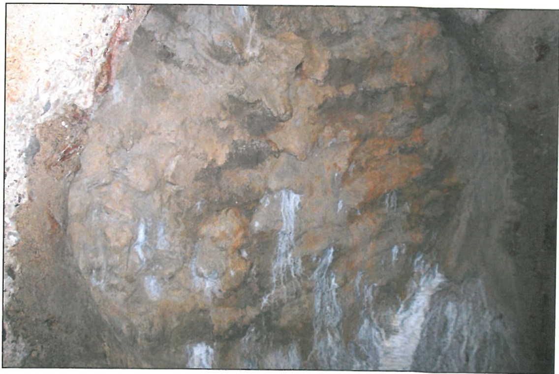
PHOTOGRAPH LOG MANHOLE/CHAMBER FEE 14.6 (SEPTEMBER 23, 2011) FORMER SAGINAW MALLEABLE IRON PLANT Saginaw, Michigan