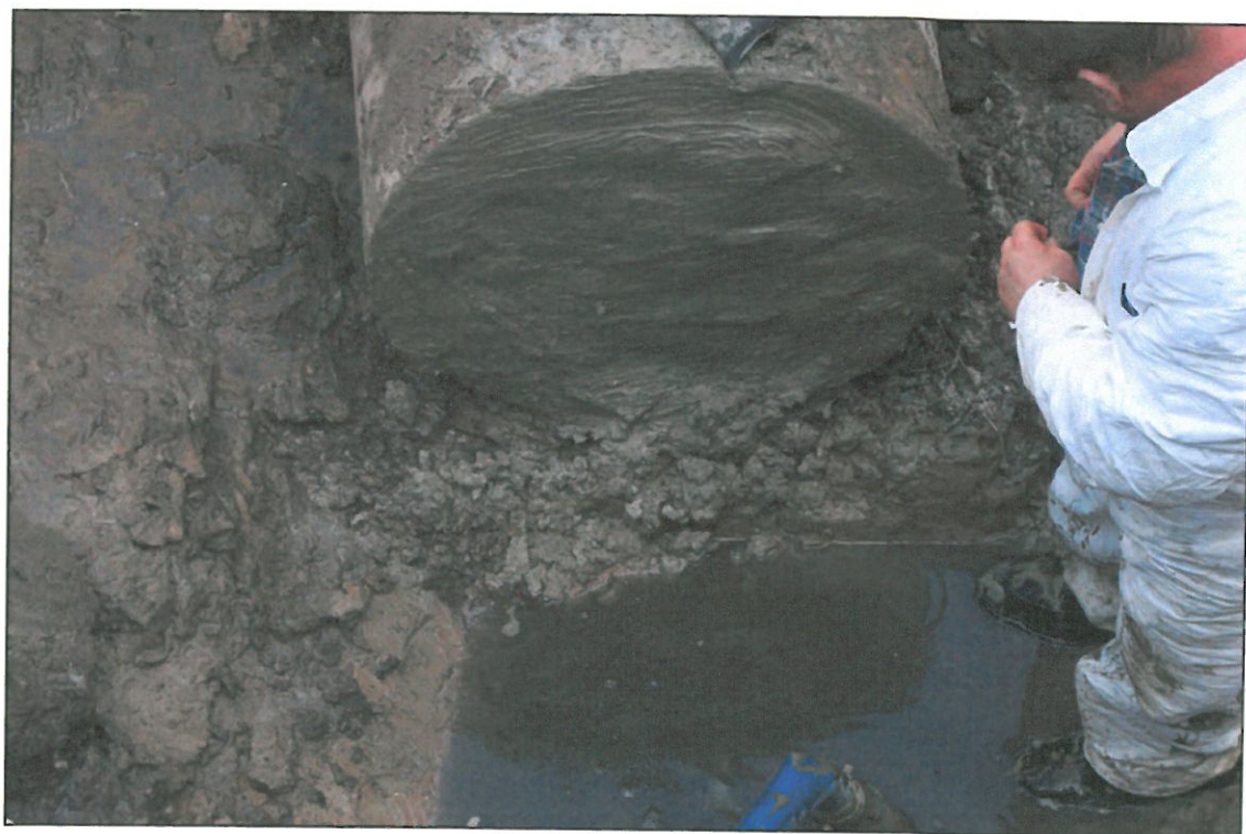
PHOTOGRAPH LOG MANHOLE/CHAMBER FA 19.5 (OCTOBER 24, 2011) FORMER SAGINAW MALLEABLE IRON PLANT Saginaw, Michigan