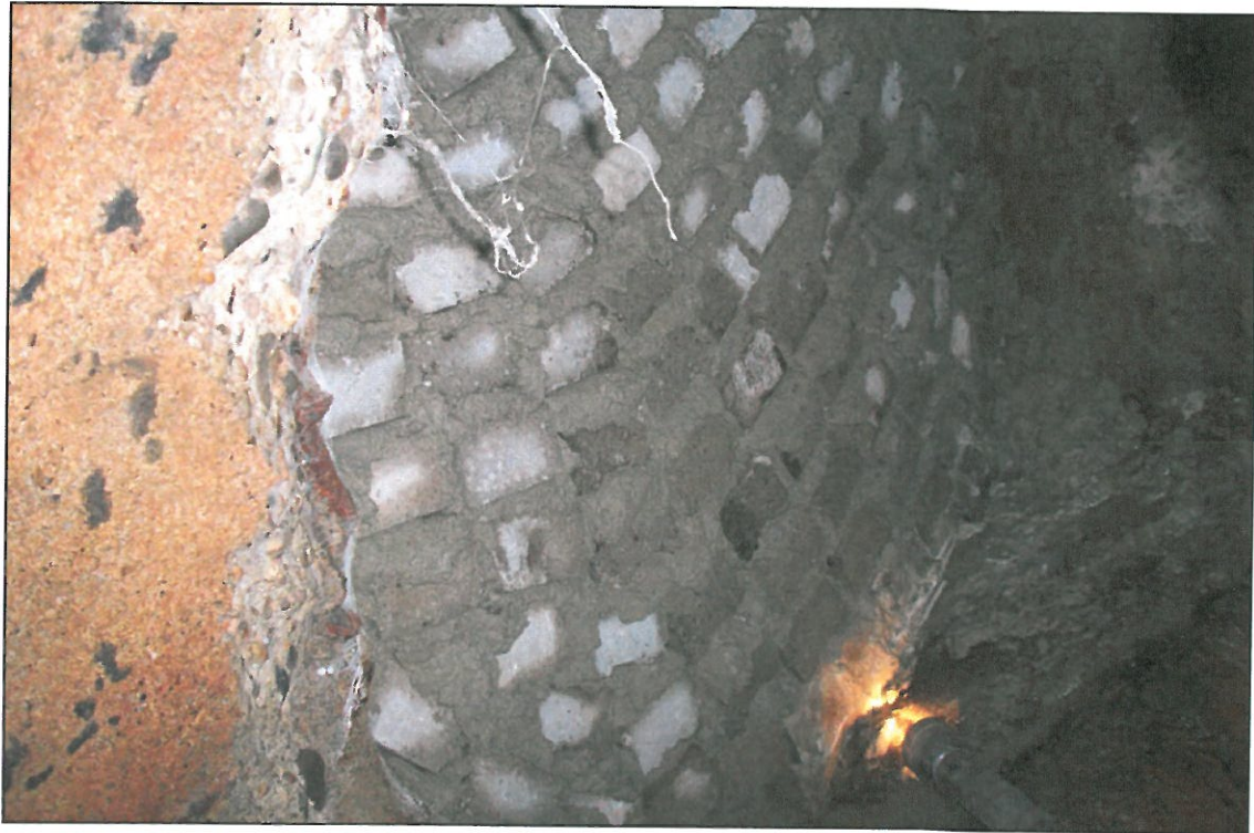
PHOTOGRAPH LOG MANHOLE/CHAMBER FEE 14.6 (AUGUST 26, 2011) FORMER SAGINAW MALLEABLE IRON PLANT Saginaw, Michigan