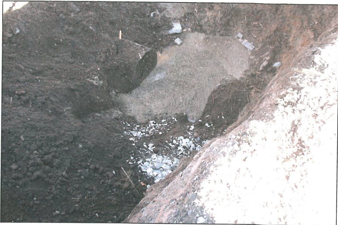
PHOTOGRAPH LOG MANHOLE/CHAMBER FA 19.5 (OCTOBER 24, 2011) FORMER SAGINAW MALLEABLE IRON PLANT Saginaw, Michigan