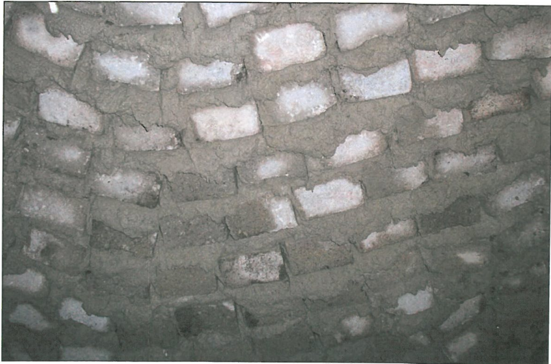
PHOTOGRAPH LOG MANHOLE/CHAMBER FEE 14.6 (AUGUST 26, 2011) FORMER SAGINAW MALLEABLE IRON PLANT Saginaw, Michigan