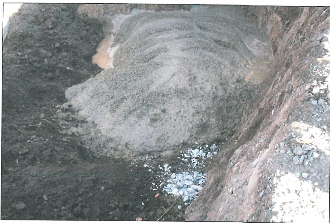
PHOTOGRAPH LOG MANHOLE/CHAMBER FA 19.5 (OCTOBER 24, 2011) FORMER SAGINAW MALLEABLE IRON PLANT Saginaw, Michigan