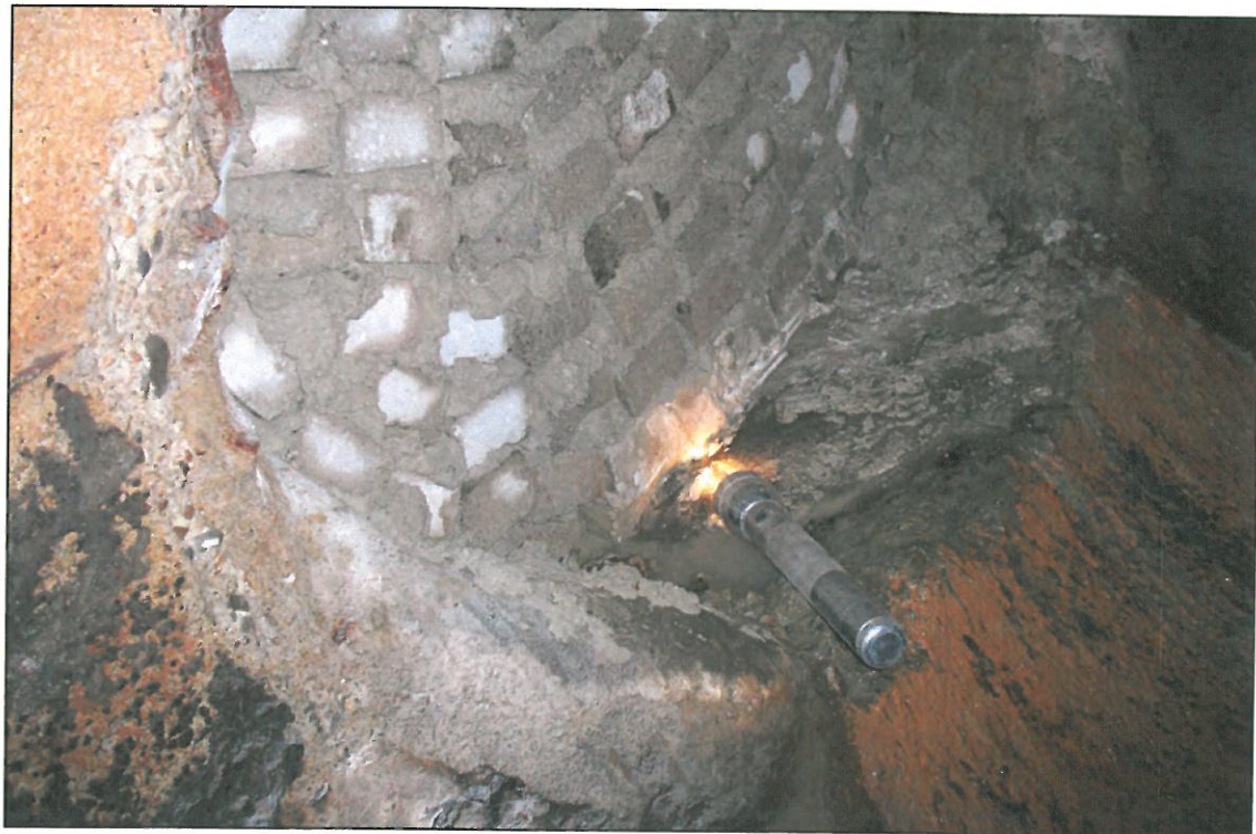
PHOTOGRAPH LOG MANHOLE/CHAMBER FEE 14.6 (AUGUST 26, 2011) FORMER SAGINAW MALLEABLE IRON PLANT Saginaw, Michigan