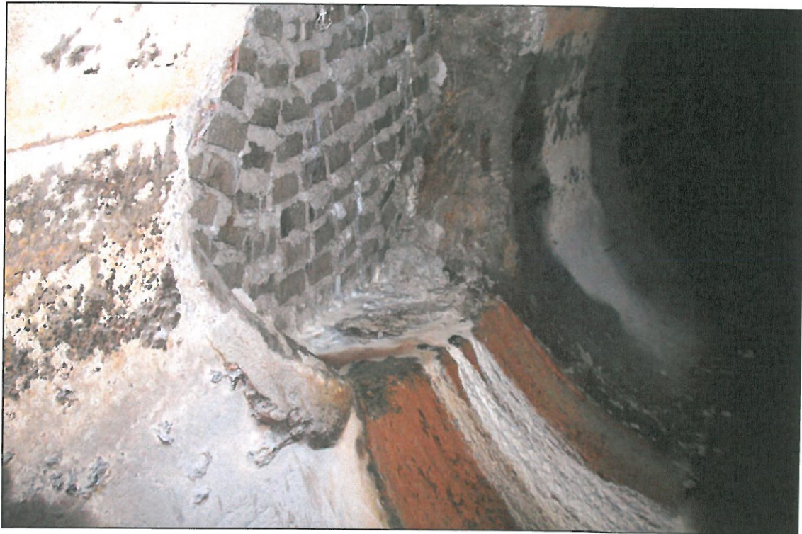
PHOTOGRAPH LOG MANHOLE/CHAMBER FEE 14.6 (AUGUST 31, 2011) FORMER SAGINAW MALLEABLE IRON PLANT Saginaw, Michigan