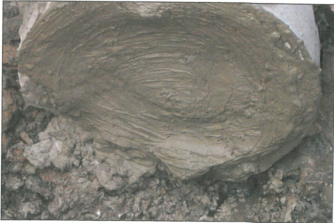
PHOTOGRAPH LOG MANHOLE/CHAMBER FA 19.5 (OCTOBER 24, 2011) FORMER SAGINAW MALLEABLE IRON PLANT Saginaw, Michigan