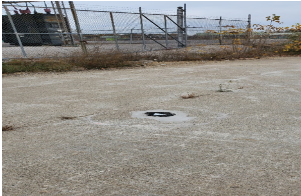
Well before Abandonment