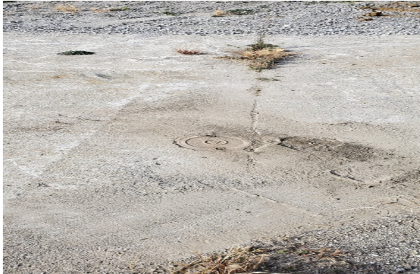
Well before Abandonment