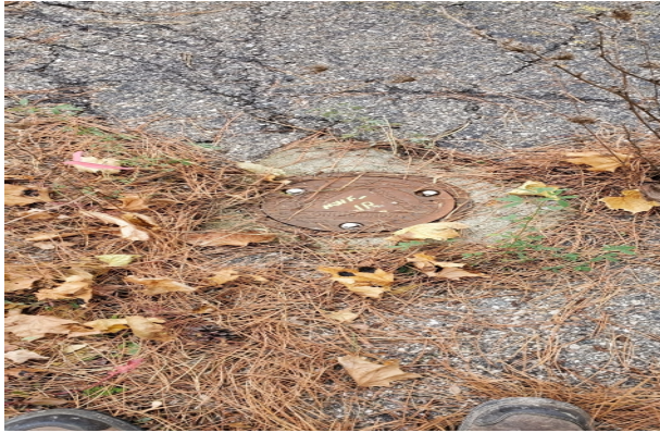
Well before Abandonment