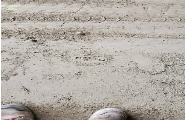
Well before Abandonment